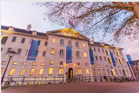
Scheepvaartmuseum, venue for Tuesday night dinner