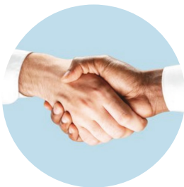
Foundation Course on Factoring

Aimed to enhance the selling and marketing skills of factoring professionals, this programme includes 3 e-learning courses: