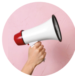
Selling & Marketing Factoring Course