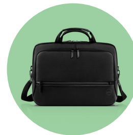
Pre-sales and Seller On-Boarding course